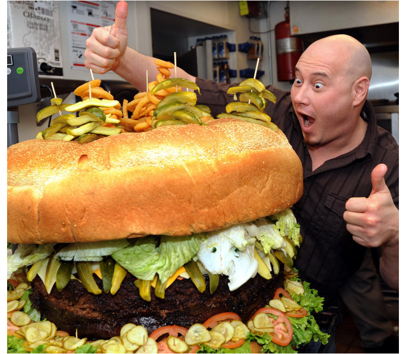
BURGER. BUUUUUUUUR-GUUUUUUUUUUUR. SO MUCH MEAT YUM YUM WHOLE BODY DIES. Here's lookin' at you, Invincible, and your two pound delicious burgers. SPEAKING OF FOOD OMG YUM STUDIO